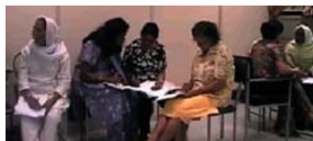
Senior nurses discuss values underlying compassion at the ministry of social services, Mauritius

A group of 7 junior doctors wrote: It was a very interesting, inspiring talk which will be very useful to us ... Thanking you!