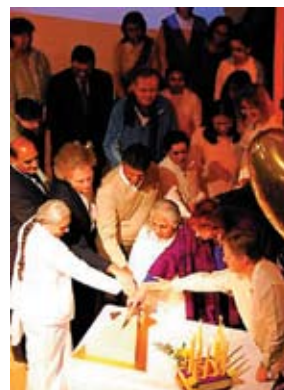
A candle-lighting celebration of 10 years of The Janki Foundation's work