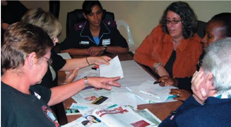
Participants discuss their vision and strategy during workshops in S Africa.