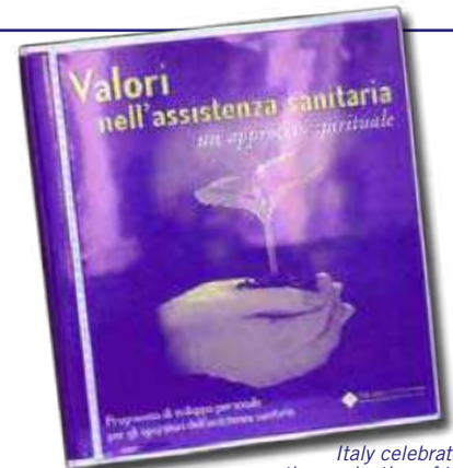
Italy celebrates the production of the translated Values in healthcare.