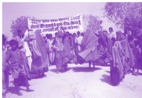
Traditional village dancing and celebrations.

If you would like further information on the Janki Foundation, to be placed on the mailing list or to become a friend, please contact: