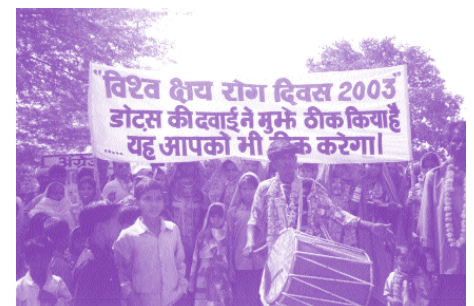
Global Hospital and Research Centre held a successful world TB day: