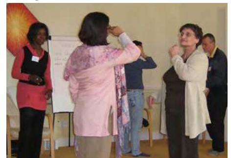
Below: The learning tools of creativity, appreciation, listening, movement and play featured strongly in the November retreat Nurturing Intuition. Bottom row: Guests get to know one another.