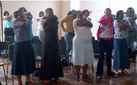
A team of social workers dealing with child trafficking in South Africa take time to nurture themselves at a VIHASA workshop. May 2010