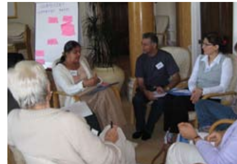
Oxford: Advanced facilitators discuss and exchange.