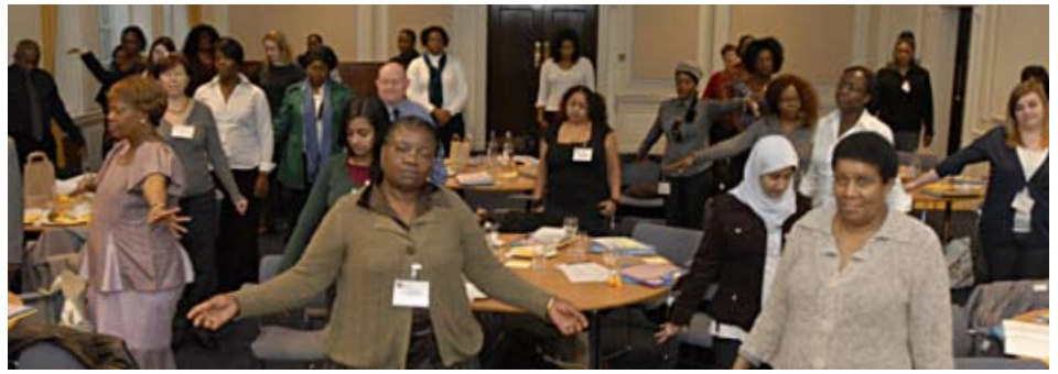
From distress to de-stressing, nurses at the RCN diversity unit event take time to stretch and relax – the workshop on Values also stimulated deep discussion.

The JF Valuing Yourself workshop was aimed at providing tools to help participants renew their enthusiasm and vitality, learn how to cope better with stress, to prevent burnout and ill health and learn how to introduce positive, values based change into care environments, enhancing reflective practice and personal developmental plans.