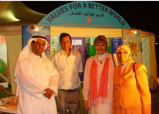
Oman: A Values in Healthcare exhibition took place at the Muscat Festival in January 2009 under the broader theme of Values for a Better World .