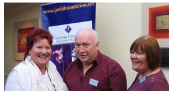
JF exhibition at the conference Reviving the Spirit Within Palliative Care Practice , Strathcarron Hospice – volunteers manned the stand.

Importance of spending time with a patient and not just focusing on physical symptoms.