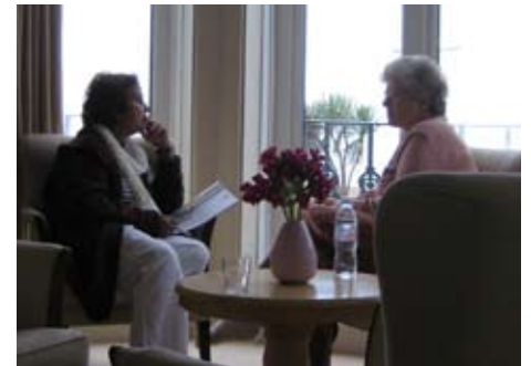
Worthing: New facilitators in silent contemplation.

It was run as a single group with two core trainers. Their comments reflected that they enjoyed partaking in the ethos of the adult learning community and felt the training equipped them to provide better care and improve communication and collaboration with colleagues!