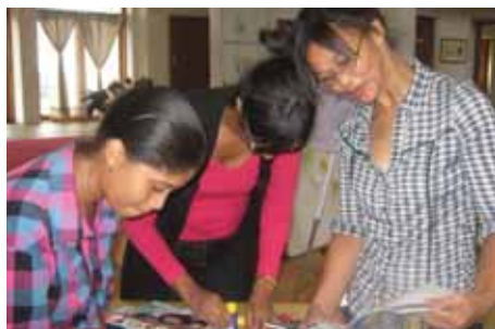
VIHASA workshop for NGO Novalis caregivers, who work with orphans and street children in Cape Town.

Durban: 36 social workers from FAMSA (a national NGO that supports FAMILIES in SA) attended a workshop on Inner Values, which they loved, in April. The director also came and has requested quarterly workshops and wants to approach FAMSA nationally to train staff in VIHASA.