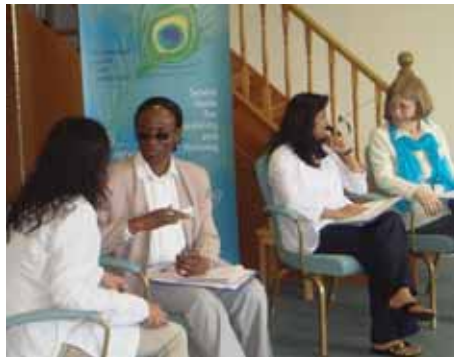
Those attending HoWB were healthcare professionals and JF office helpers.