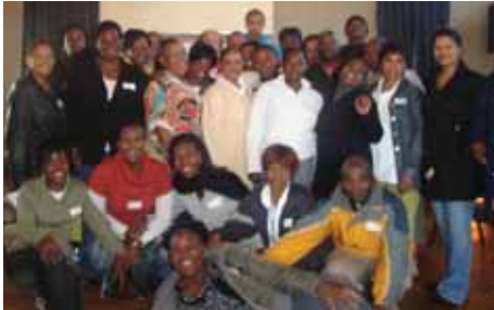
Johannesburg: NGO PUSH delegates with VIHASA facilitators after compassion workshop.