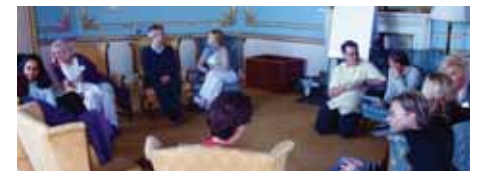
The retreat delegates contemplated and conversed. Later they relaxed while participating in workshops on sound, laughter, Wu Chi (pictured below) and sacred dance.