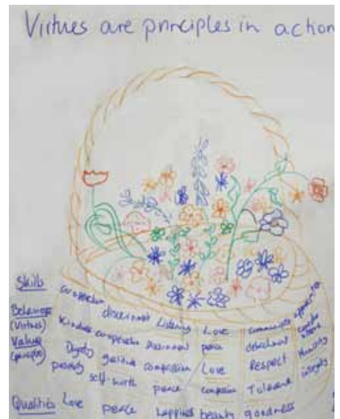
Right: Values, qualities and skills are transformed literally into a basket of virtues.