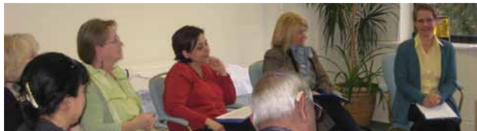
Above: November workshop in JF office on Caring for patients, caring for yourself.