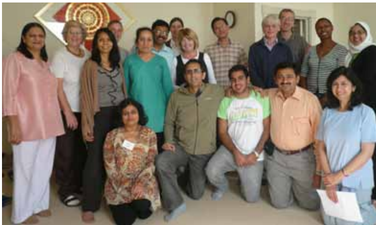
Left: The September training in Worthing welcomed guests from all over the world.