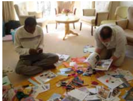
Above: Some create montages to portray their vision of a healing space.